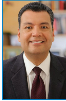
Alex Padilla Democrat Current Secretary of State