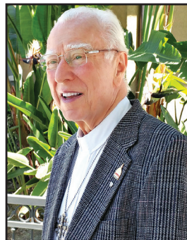
Rev. Lou Sheldon TVC-ELI Founder

TVC – ELI is dedicated to protecting religious freedoms and traditional family values. The California Voter Guide will empower you as a voter with the knowledge needed to make a lasting moral impact on public policy.