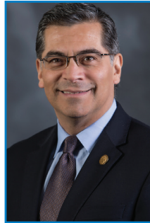
Xavier Becerra Democrat Current CA Attorney General